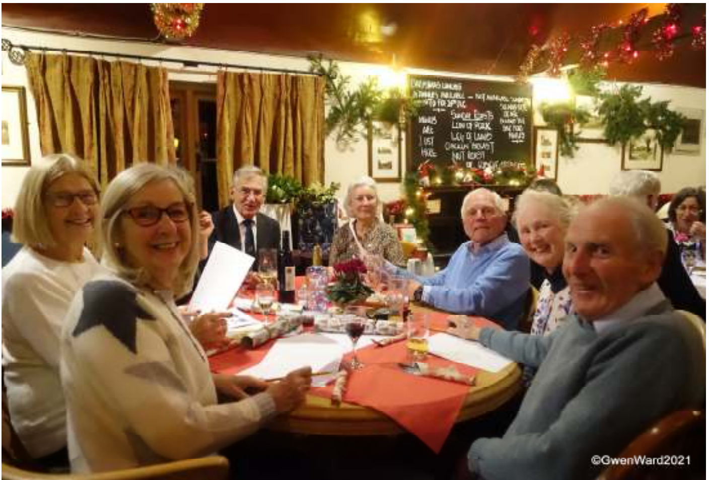
Fun at The Brickies (courtesy of Gwen Ward))

No meeting in January - next meeting February 1 st 2022 Arbutnot Hall 7.30pm Timothy Woodland Container Planting for all Year Round Colour